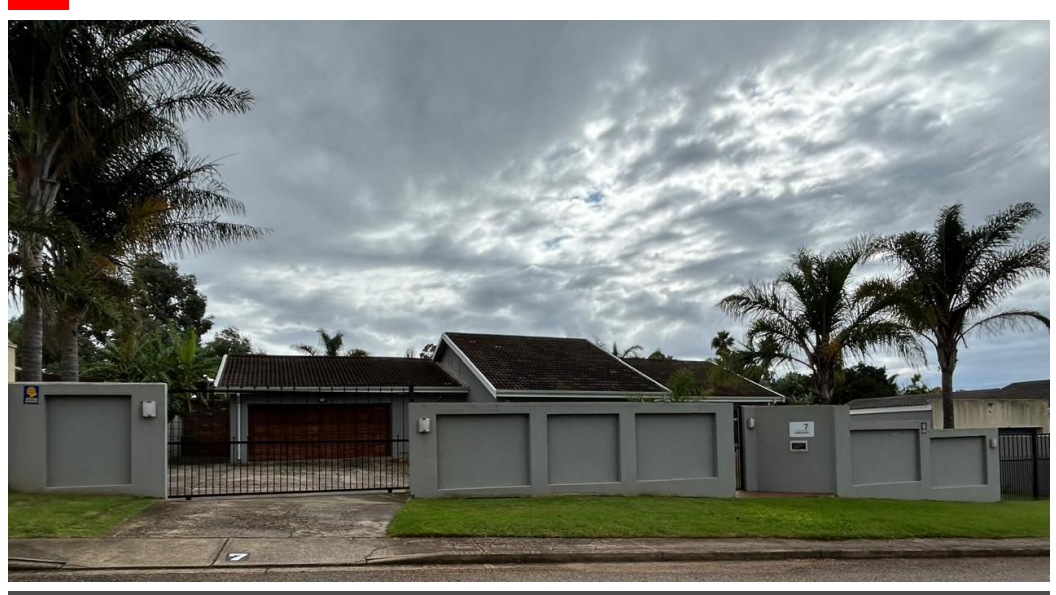
Web Ref RL6708