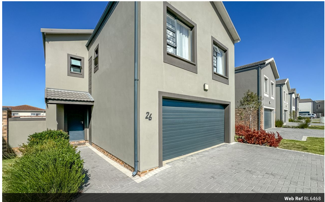
Web Ref RL6468