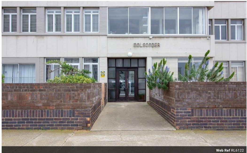
Web Ref RL6122