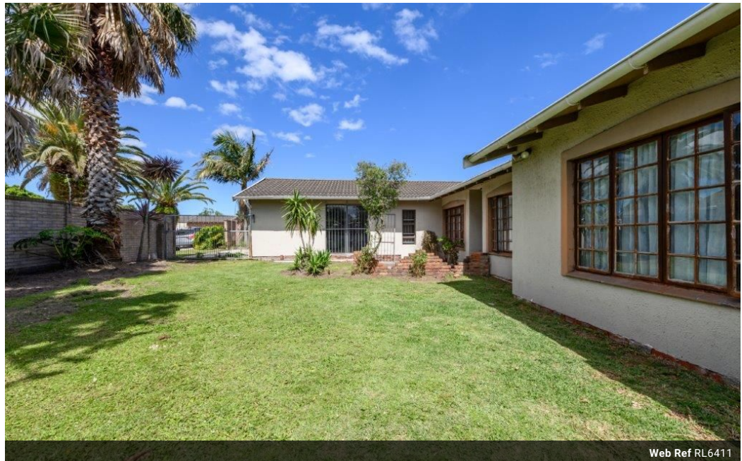
Web Ref RL6411