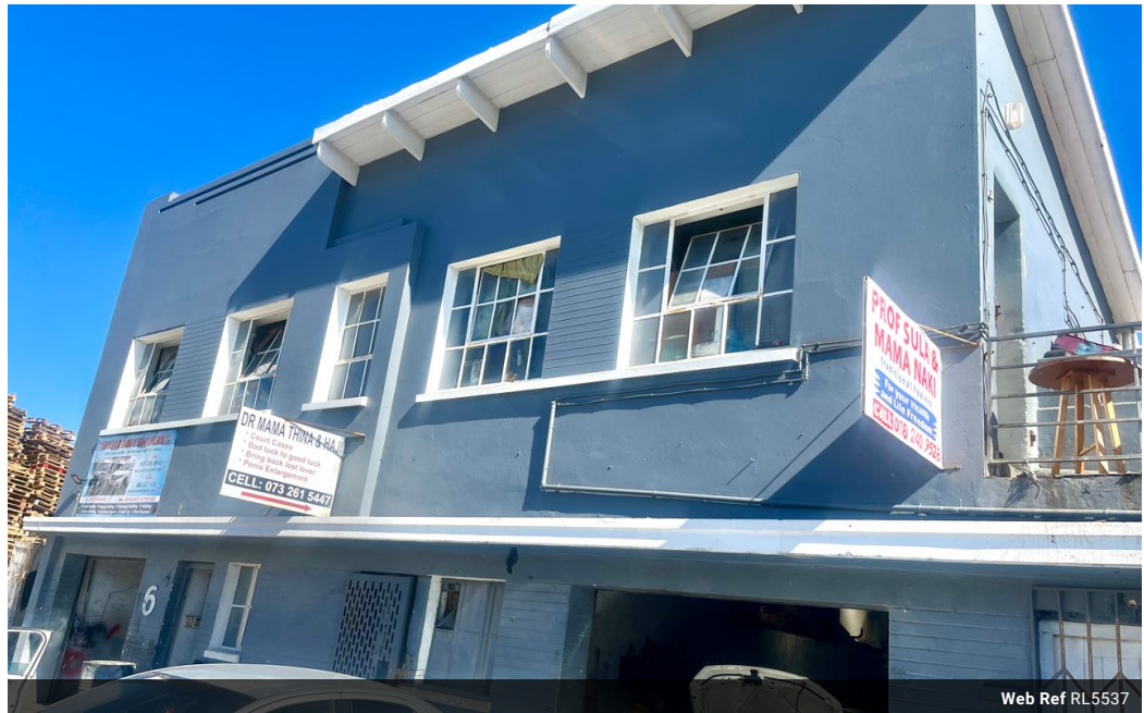
Web Ref RL5537