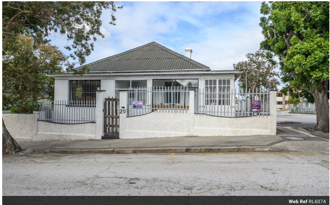
Web Ref RL6074