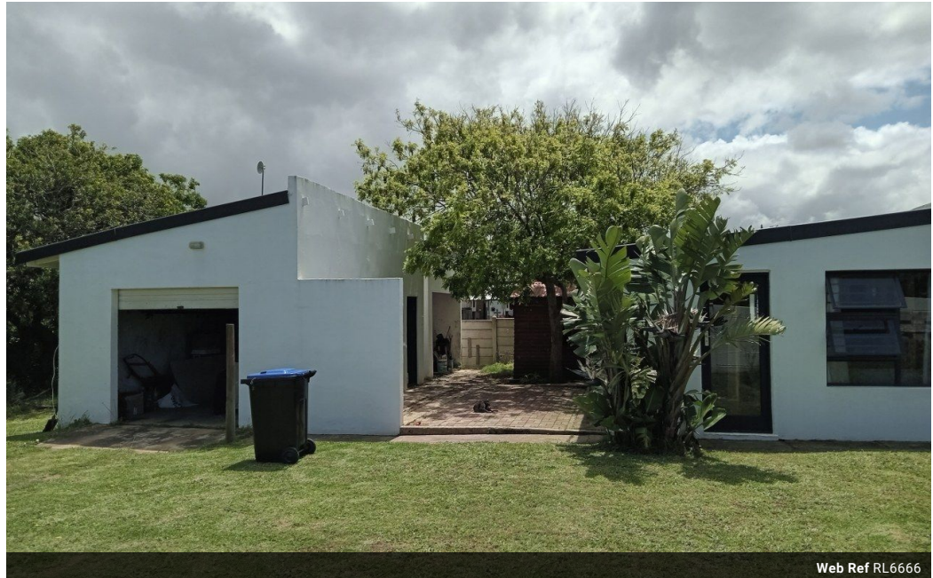
Web Ref RL6666