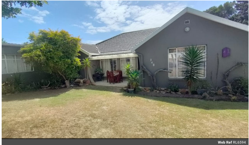
Web Ref RL6594