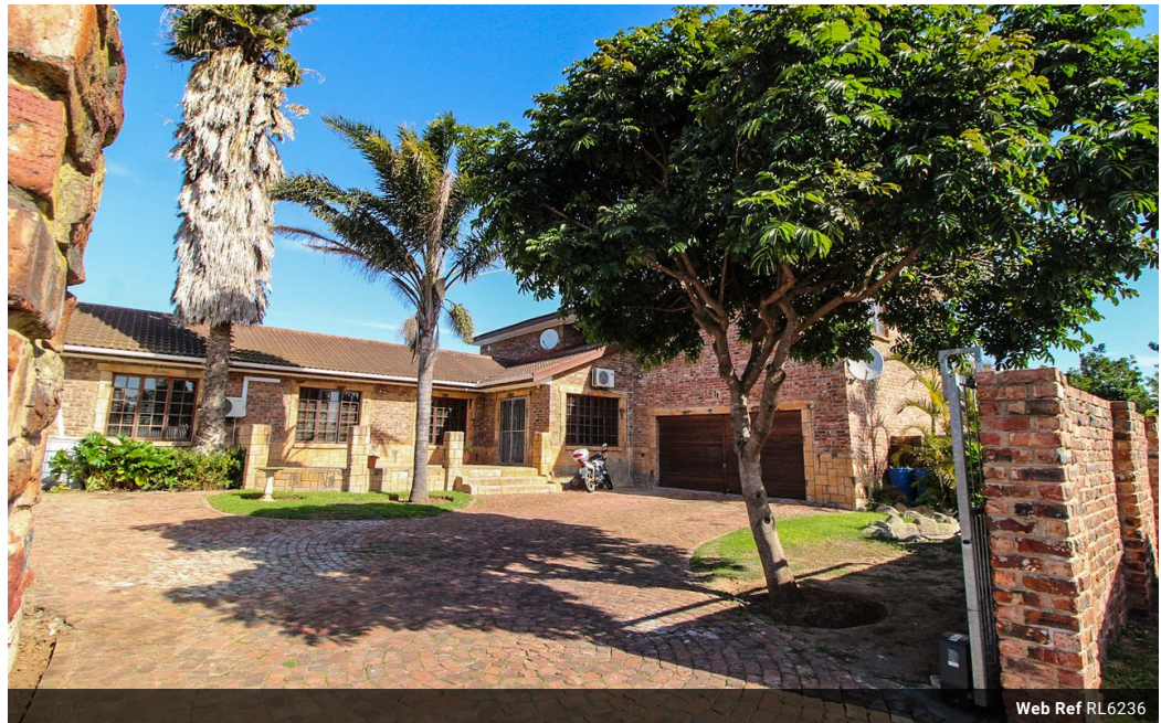
Web Ref RL6236